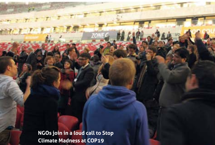
NGOs join in a loud call to Stop Climate Madness at COP19

CAN Europe staff attended all UNFCCC negotiating sessions in 2013, including inter-sessionals in Bonn and COP19 in Warsaw, once again coordinating the work of European NGOs inputting into the UNFCCC process.