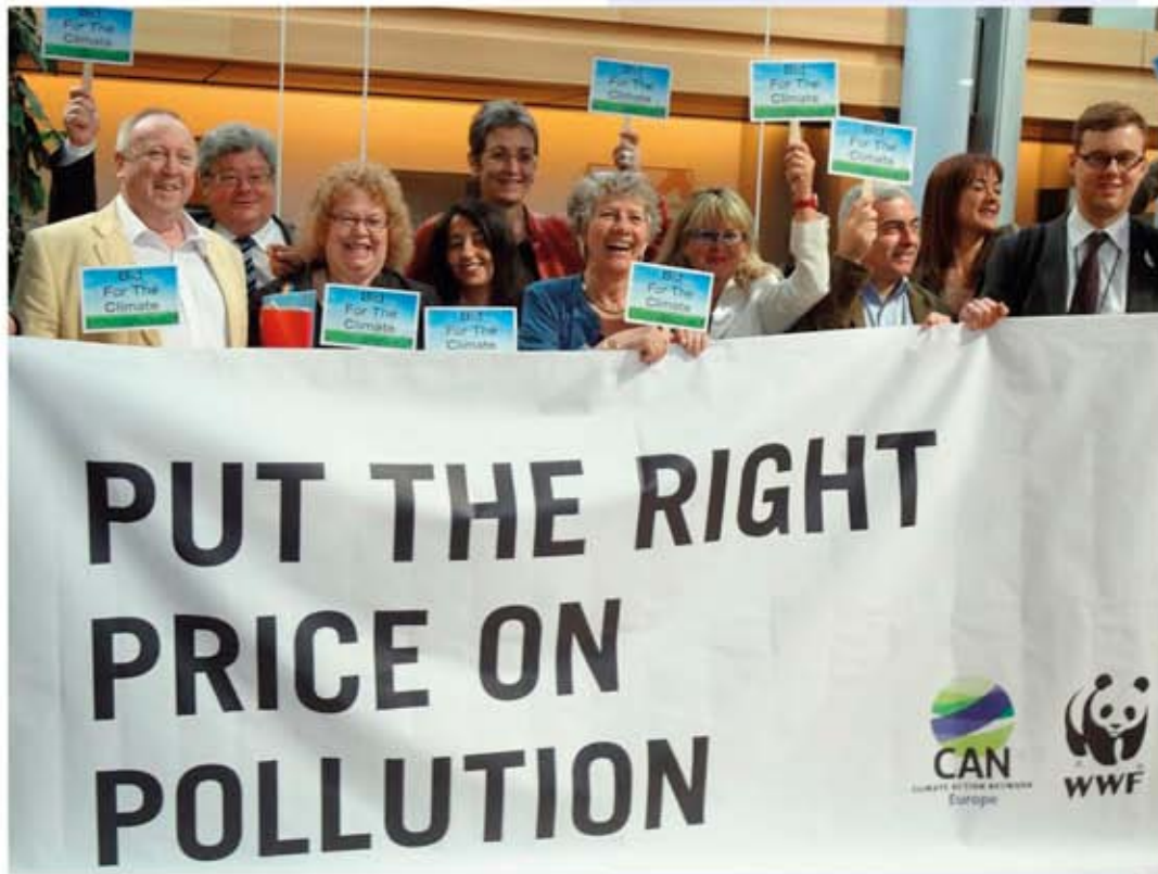
MEPs bid for the climate in Strasbourg before the backloading vote

CAN Europe and its members targeted MEPs with letters, campaign materials, voting recommendations, papers, briefings and country-specific arguments in favour of backloading. We called on the EP to support the measure in op-eds published in Brussels media and successfully generated attention by organising a media stunt: a colourful open-air “carbon auction” in Brussels. In March we organised a lobby workshop attended by number of our members who came to Brussels to promote ambitious backloading with their MEPs. With other Brussels NGOs we published the Future Times spoof newspaper, predicting Europe’s shiny future if backloading was approved. Furthermore, CAN developed a successful online registry of MEPs’ EU ETS voting records, which was heavily used by our members.