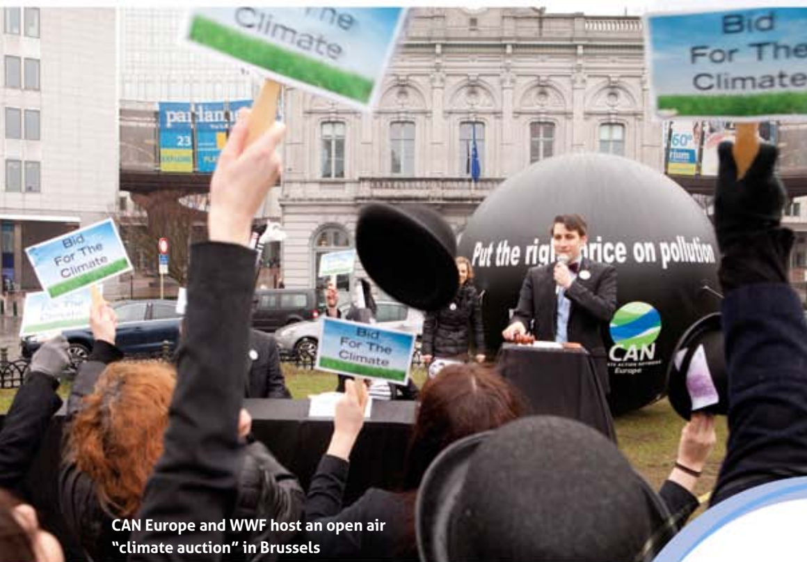
CAN Europe and WWF host an open air "climate auction" in Brussels