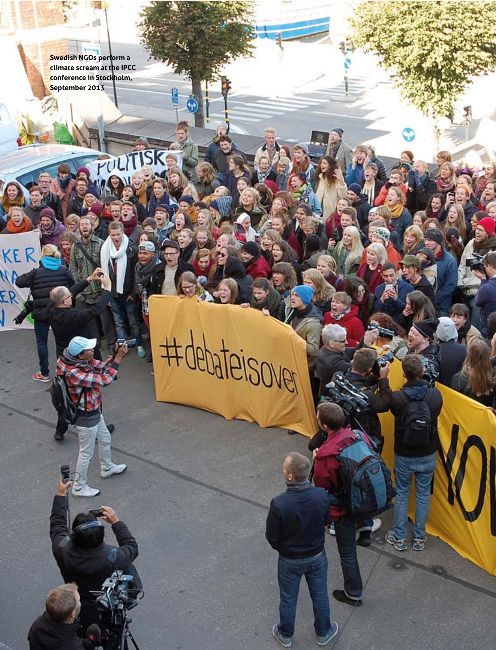
Swedish NGOs perform a climate scream at the IPCC conference in Stockholm, September 2013