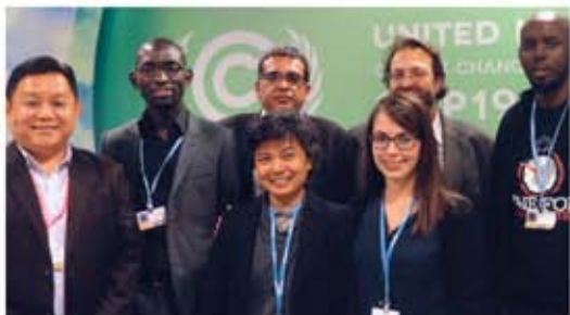
CAN Europe's director – back row, second from right – joined CAN International's Board as Treasurer in November 2013

CAN Europe's director remains an active member of the CAN International and CAN South Asia Boards and at the end of 2013 was elected to become the CAN International Treasurer. In addition, our Director worked closely with CAN South Asia on inclusion of aviation in the EU Emissions Trading System.