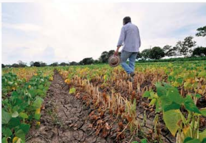
Drought tolerant beans in Colombia

During the process, CAN Europe began outreach to members on how to ensure the EU and national Member States keep both mitigation and adaptation high on the development agenda. CAN Europe joined the steering committee of the European Task Force of Concord's Beyond2015 campaign, which sets out to ensure that the EU remains as ambitious as possible in its position for a universal post-2015 framework. Through this task force, CAN Europe has worked to ensure that climate change is strongly reflected in European civil society positions and arguments to EU institutions including DG ENVI, DG DEVCO and the EEAS, as well as Member State governments.